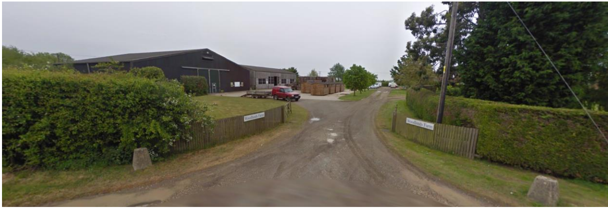
Woodlands Farm, Wash Road, Kirton PE20 2DN